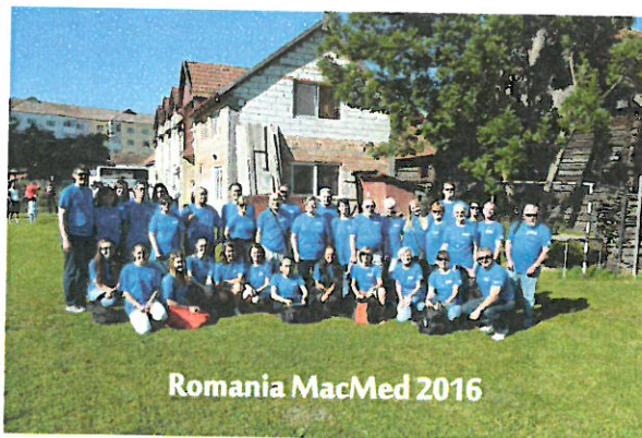
Romania MacMed 2016