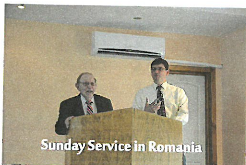
Sunday Service in Romania