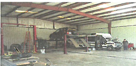
Garage in Nancy, Kentucky