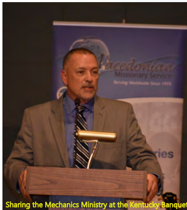
Sharing the Mechanics Ministry at the Kentucky Banquet.